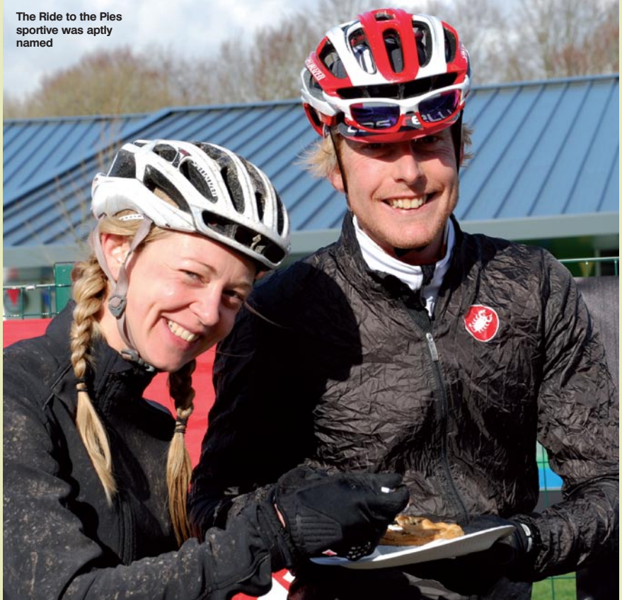
The Ride to the Pies sportive was aptly named

The next event in the series starts and finishes at Guildford on Sunday 29th May. For more information or to enter visit ctcchallengerides.co.uk or call the CTC Information Office.