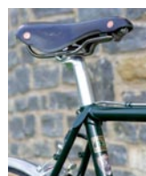
The Brooks leather saddle, 'wrap-around' seat stays and 531 tubing provide a period feel.

Most importantly, for touring cyclists, the Clubman provides an efficient yet