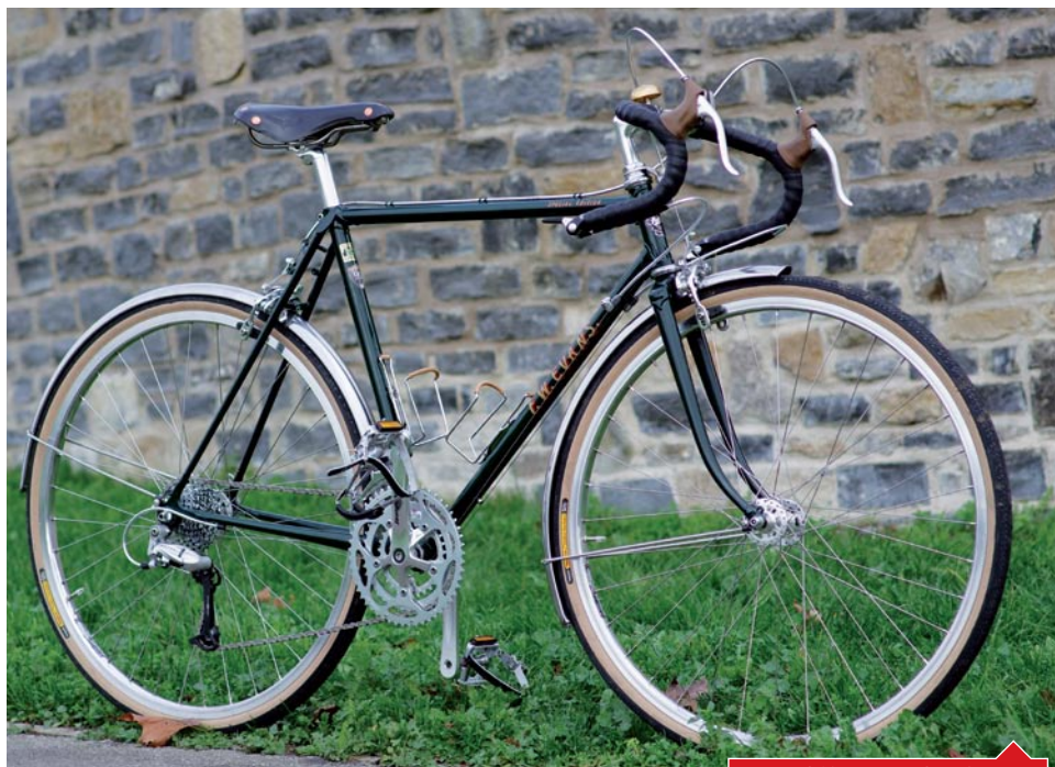
FW EVANS 90TH ANNIVERSARY CLUBMAN