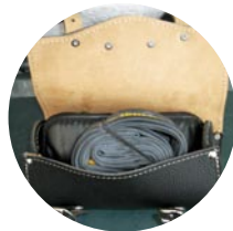
The Derwent saddlebag is well made but compact. Expect to fit tools and spare tube only

Leather does need looking after, so I applied generous amounts of Proofide before fitting the saddle to my bike. There's one small snag here: the saddle has a 'boot lace' underneath, with which you can pull in the saddle sides. Depending on how much you want to move the saddle on its cromoly rails,