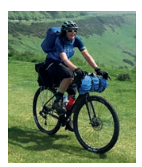
Above: The Bombtrack was well suited to the Dorset Gravel Dash, a 100-mile journey on road and off

My first rides fed my doubts. With a rigid fork, a narrow bar (in off-road terms), and my weight forward, rutted, rooty and rocky terrain was a challenge, and my hands weren't strong