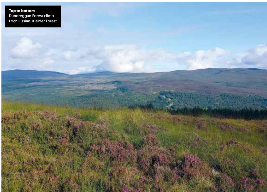
Top to bottom: Dundreggan Forest climb. Loch Ossian, Kielder Forest

Riding gingerly, I reached a road after a few miles. Next aim: a new tyre.