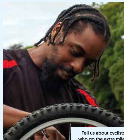
Tell us about cyclists who go the extra mile

National Volunteers' Week from 1-7 June is an annual celebration of the tremendous contribution made by so many people to encourage more of us to go cycling. It's a chance to thank our volunteers for maintaining morale in their clubs and groups over the past year, and to acknowledge the impact of those who haven't been able to carry out their usual tasks. See cyclinguk.org/volunteer to nominate someone for a 'Going the Extra Mile' award 2021.