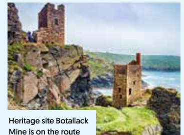
Heritage site Botallack Mine is on the route

Cycling UK is creating a new off-road adventure route in west Cornwall. The 150-mile West Kernow Way will explore the history, culture and landscapes of the Penwith and Lizard peninsulas. Launching in autumn, the trail is part of the EU-funded EXPERIENCE project to promote sustainable, year-round tourism in the region. cyclinguk.org/west-kernow-way