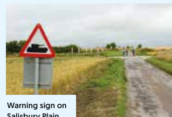
Warning sign on Salisbury Plain

Cycling UK is supporting the Ministry of Defence's Respect the Range campaign to encourage the public to stay safe on military land. Many of these areas are fantastic for cycling but are also in frequent use for military training. Check the firing times before you go, stick to marked routes, and look out for information signs and red flags. cyclinguk.org/article/respect-range-and-stay-safe-military-land