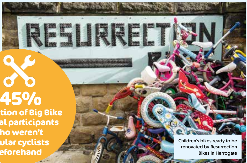
Children's bikes ready to be renovated by Resurrection Bikes in Harrogate

Many cyclists are taking staycations this year. Those who do can look out for places signed up to a new free accreditation scheme for tourism businesses that's been launched by Cycling UK. Cycle Friendly Places is operating in three regions – Norfolk, Kent, and Cornwall – and is part of the EXPERIENCE project co-funded by the European Regional Development Fund.